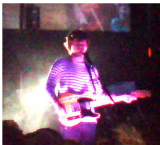
Jack Peñate headlines Eastbourne music festival

On the first day indie pop icon Jack Peñate headlined the main stage accompanied by Radio One's eclectic DJ Zane Lowe. On the second day of the festival, the headlines were drum n' bass stars Pendulum, DJ Hype and MC Verse.