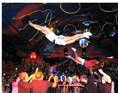
The rugby boys in action

Forget stereotypes. The rugby boys were again victorious in the Chelsea School's annual Dance Rivals event. Sleek, athletic and as co-ordinated as a rowing eight in full flight, the team put on a dazzling display of choreographed physicality. Now in its sixth year, Dance Rivals drew 13 teams and hundreds of spectators to Eastbourne's prestigious nightclub Atlantis on the pier and this charity event raised over £3,000 for the Chelsea Children's Camp.