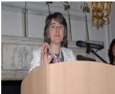
Baroness Finlay AHPRN launch

The NPRN was always designed to be all-inclusive and welcoming to anyone interested in research related to physiotherapy (including students, clinicians, managers, academics etc). Over the years, the activities in these hubs have attracted a large number of other Allied Health Professions to the hub events, and it seemed sensible to the Core Executive to change the name of the network in order to truly represent the network and to recognise the desire, need and opportunities for cross-disciplinary working in research and evidence based practice.