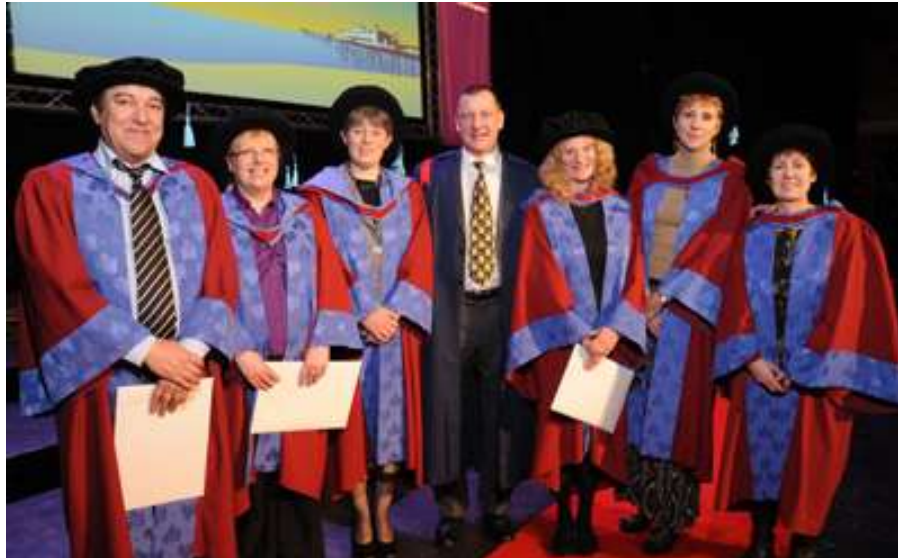
Clinical Research Centre for Health Professions' graduates 2011 and supervisors