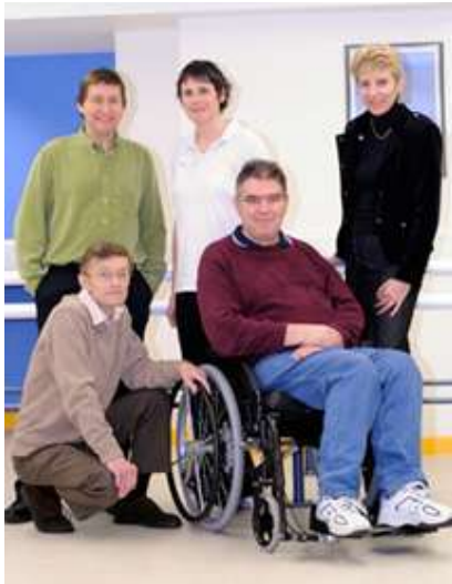
The Neater Uni-wheelchair team

This small research group continues to progress the research in the field of posture, mobility and assistive technology. The Neater Uni-wheelchair continues to attract national and international