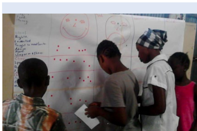
Data collection with children

In 2012, PKL mobilized and trained community members, including community leaders, teachers, police, and parents, to establish a community-based child protection committee (CPC) in Korogocho, one of Nairobi’s slums in which PKL operates. This CPC is responsible for identifying cases of child abuse within the community and referring these cases on to appropriate agencies for support, such as police departments, health centres, or other non-governmental organisations. Training themes include child rights, child protection, and positive discipline.