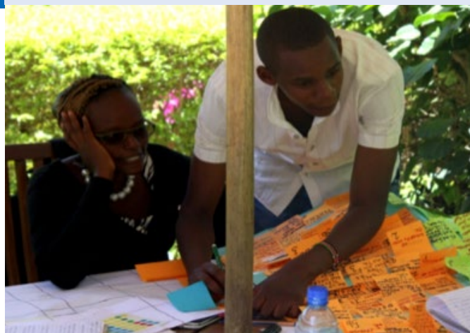
Training of research team and identification of PAR methods

The research was conducted in three phases. The first phase involved analysing previous monitoring and evaluation reports and jointly developing the framework for research for the following phases. A team of 15 Kenyan researchers trained in qualitative, child-focused research methods carried out the second and third phases. More than 200 marginalised girls were consulted in focus group discussions. Detailed case studies were developed on 48 of these girls using interviews with the girls, their families, and a range of