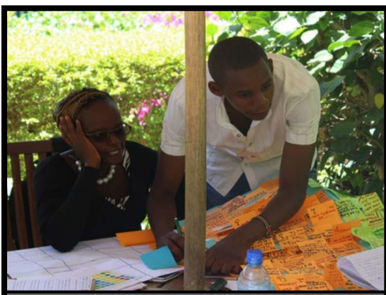
Figure 1: Training of research team and identification of PAR methods

The research was conducted in three phases. The first phase involved analysing previous monitoring and evaluation reports, and jointly developing the framework for research for the following phases. Phases two and three were carried out by a team of 15 Kenyan researchers trained in qualitative, child focused research methods. Over 200 marginalised girls were consulted in focus group discussions, and 48 of them were followed up to provide more detailed case studies which